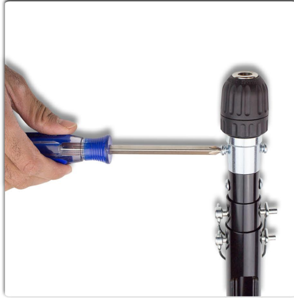
Step 2. Use a Phillips head screw driver to secure the Keyless Chuck to the LMP BASE