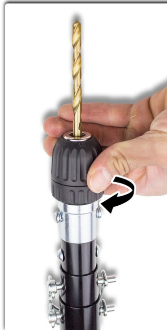
Step 4. Insert a driver or drill bit into the chuck and secure it by turning the top portion clockwise