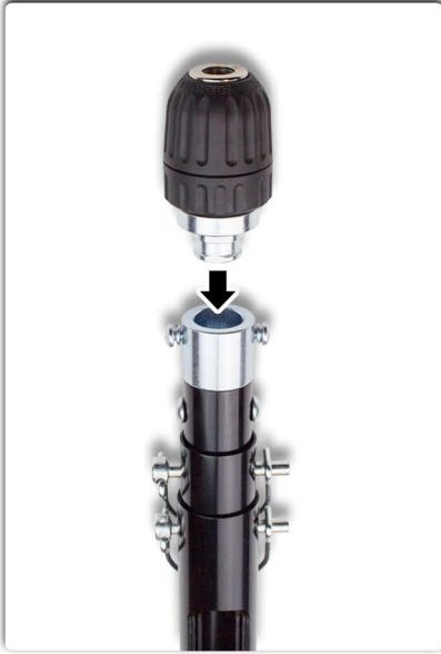
Step 1. Insert the Keyless Chuck into the LMP BASE of the pole tool